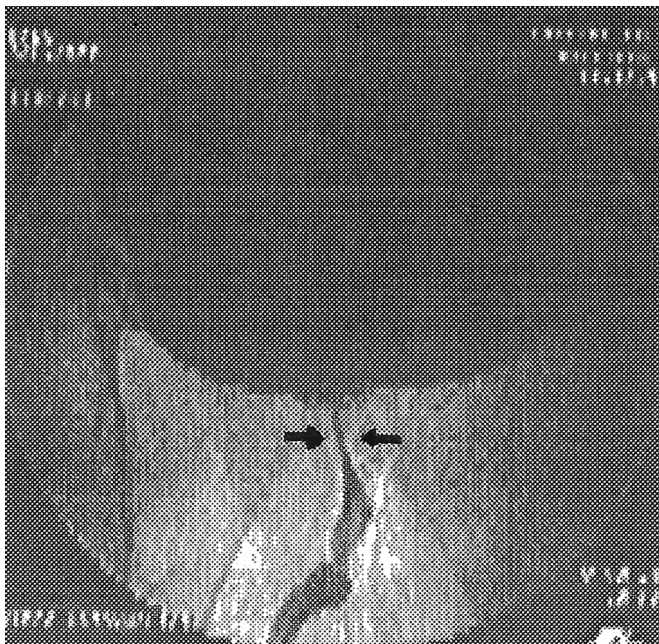
FIG. 2. Voiding cystourethrography at maximum urine flow reveals obstruction site (arrows).

our patient population. In our experience there is a high likelihood of prostatic and/or vesical neck obstruction in these cases but to our knowledge neither this observation nor the association with upper tract pathology has been previously documented in the peer-reviewed literature. The AUA symptom score, voiding diary, uroflowmetry and post-void residual urine volume measurement are some noninvasive tools used to assess lower urinary tract symptoms. However, none of these tests reliably diagnoses bladder outlet obstruction. In view of the high likelihood of significant urethral obstruction, bladder diverticulum and upper tract abnormalities in our group with enuresis we believe that video urodynamics and upper tract imaging should be routinely performed in patients with adult onset enuresis.