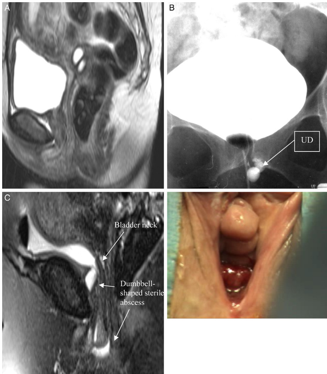
Figure 1. Inaccurate UD diagnosis. A and B, in patient 1 UD was obvious at operation and on VCUG but no MRI findings caused UD suspicion, perhaps due to lack of contrast medium. A, MRI. B, VCUG shows anterior vaginal wall, similar to surgical view. C, patient 17 was diagnosed with UD by MRI but had dumbbell-shaped sterile abscess. No communication with urethra was seen and cavity was filled with thick white urethral bulking agent fluid. When abscess proximal portion was compressed with finger, distal portion protruding from meatus became tense.

table). At operation the UD were substantially different in size and configuration than on MRI (fig. 2, B). Thus, decision making became challenging in terms of dissection and excision extent and direction. Two patients (4.9%) were diagnosed with cancer (squamous cell carcinoma and adenocarcinoma in 1 each) within the UD by palpation in the operating room but had no suspicious findings on preoperative MRI (see table and fig. 2, C). In each case the only abnormality was UD wall hardness and thickness. No discrete mass was noted. Each patient had