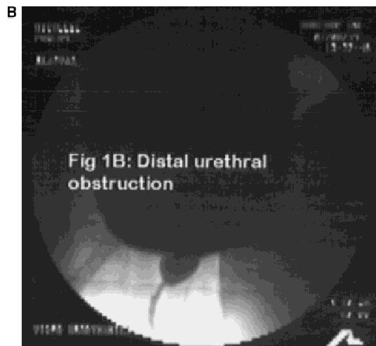
Fig. 1. A: Distal urethral stricture: urodynamic findings. B: Distal urethral stricture: fluoroscopy.